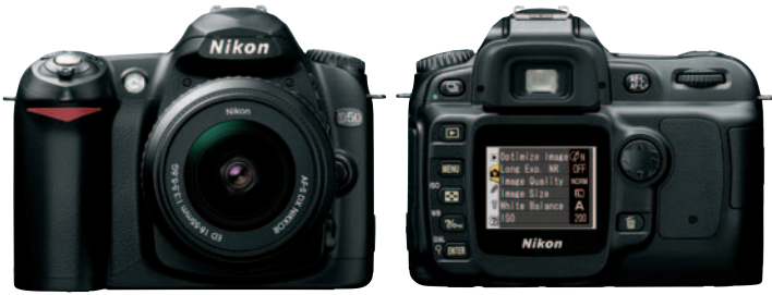
Menus can be displayed in a choice of 13 different languages: English, German, French, Spanish, Italian, Japanese, Dutch, Swedish, Simplified Chinese, Traditional Chinese, Korean, Russian, Portuguese