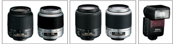
New AF-S DX Zoom-Nikkor 18-55mm f/3.5-5.6G ED

Support for Nikon's Total Imaging System includes compatibility with a wide variety of high-quality Nikkor lenses and the Speedlights SB-800 or SB-600 of Nikon's Creative Lighting System.