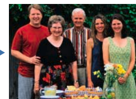
With Pixel Polish