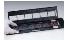
35mm Film Holder FH-M10