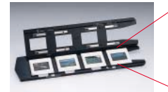
Slide Mount Holder SH-M10