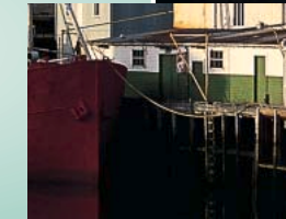
Multi-sample scanning on