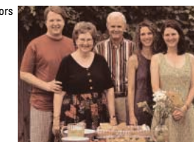
Without Pixel Polish