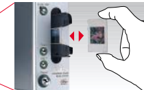
Single slide replacement possible

Specification figures are based on Minolta's standard test method,