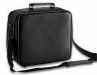
Carrying case L1629A

Easily connect to a wide range of video equipment, from a VCR to a camcorder.