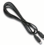
6-foot S-video cable L1635A

Lightweight and easy to carry with a built-in handle, this mobile screen sets up easily anywhere you need it.