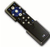
Premium wireless remote control with USB L1631A

The lightweight and sturdy design allows you to take it wherever you need to present.