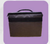
Soft carry case (4G.01203.001)