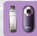
Presentation plus (5J.J9301.001)