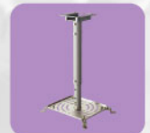
Universal ceiling mount (5J.J2K01.001)